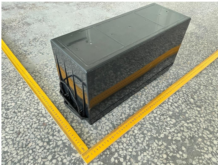
Figure 2 Overall view II of battery (外观图II)