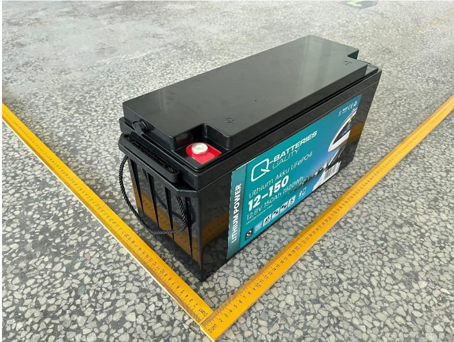
Figure 1 Overall view I of battery (外观图I)