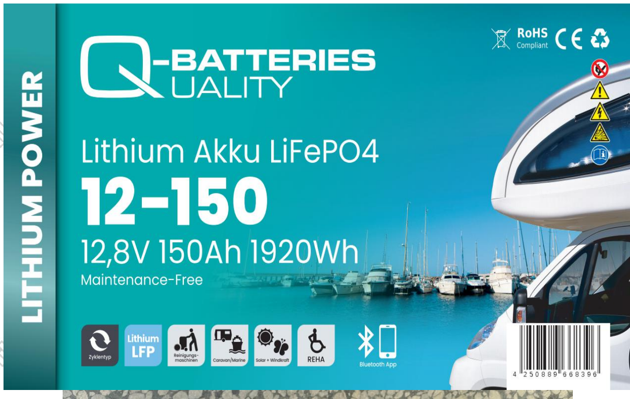
Figure 4 Battery Label (电池标签)