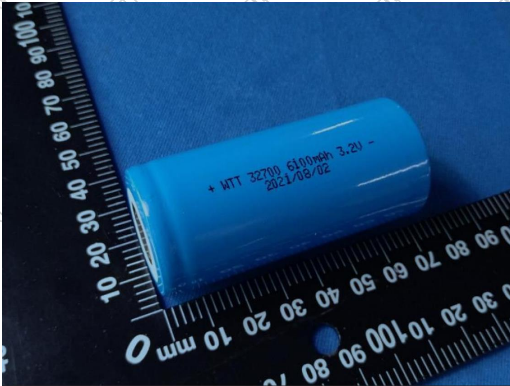
Figure 3 Overall view of cell (电芯图)